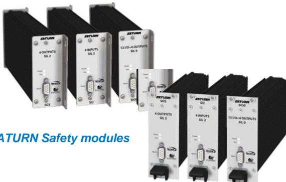
■ SATURN Safety modules

Based on an open protocol (available on demand), the SATURN platform is a product portfolio built on a generic concept. It supports mixed heterogeneous configurations of SIL0, SIL2, and SIL4 modules on the same unique copper cable or fibre optic-based communication network. SATURN allows system engineers to design fully integrated, efficient, and cost effective I/O management systems for train operations with both safety-critical and non-safety-critical equipment on the same data network. The SATURN platform can be expanded by adding self-contained or custom I/O modules to match any application requirements;