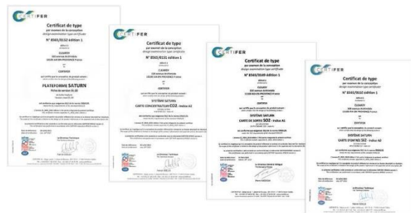
■ SIL2 certificates